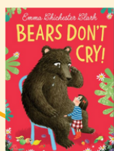
Bears Don't Cry! by Emma Chichester Clark