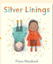
Silver Linings by Fiona Woodcock