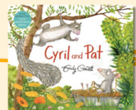
Cyril and Pat by Emily Gravett