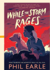
While The Storm Rages by Phil Earle