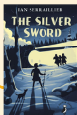
The Silver Sword by Ian Serraillier