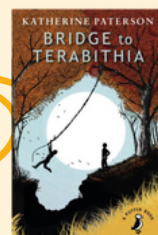
Bridge To Terabithia by Katherine Paterson