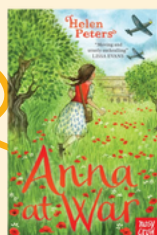
Anna At War by Helen Peters