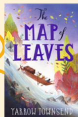
The Map of Leaves by Yarrow Townsend