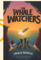
The Whale Watchers by Dougie Poynter