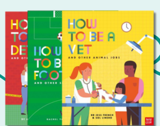
How To Be A... series by Nosy Crow