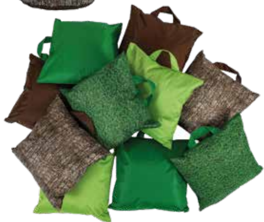
Grab & go cushions – nature