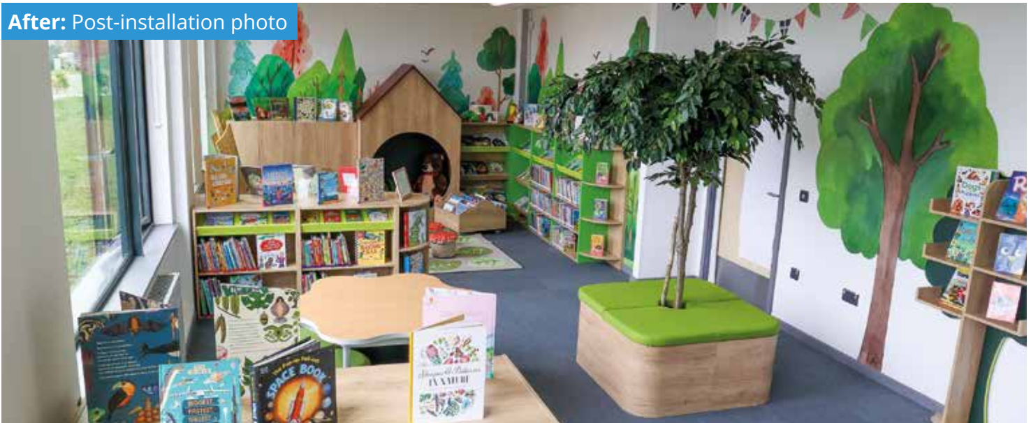
After: Post-installation photo

The Peters team of Children's Librarians and Book Specialists also selected books to fill the school's new shelves, creating an engaging and diverse book selection to complement the design, encouraging children to explore and discover.