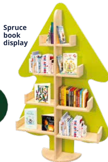
Spruce book display