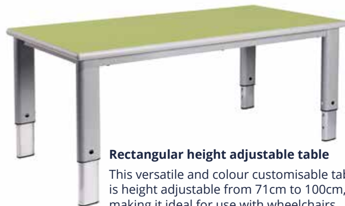
Rectangular height adjustable table

The perfect storage solution for primary schools. The tray units are available in a variety of sizes and finishes to suit your classroom.