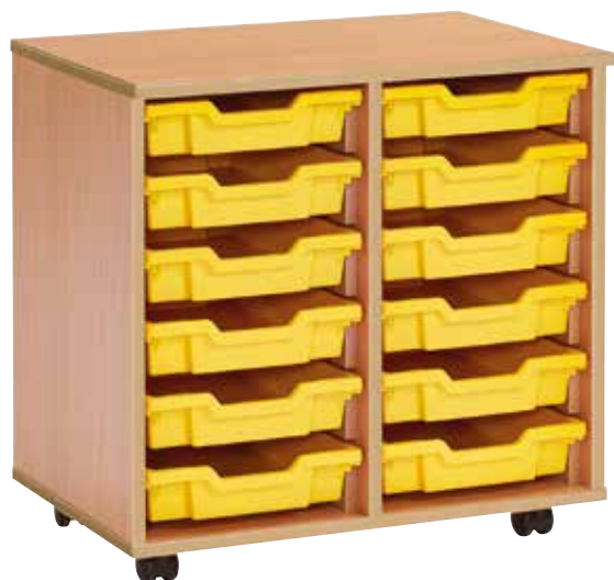
Mobile double tray unit

The Segga table offers ultimate flexibility for your classroom. Tables can be arranged into multiple shape combinations and stacked spirally for easy tidying.