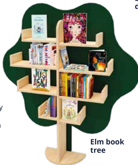
Elm book tree

Amazing for small groups and storytime, our woodland-inspired soft seating and cushions can transform a library or reading corner into the wild world outside. They are made from water resistant polyester fabric, making them ideal for indoor and outdoor use.