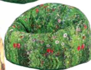
Learn about nature beanbag bundle

Find more nature-themed furniture and accessories online